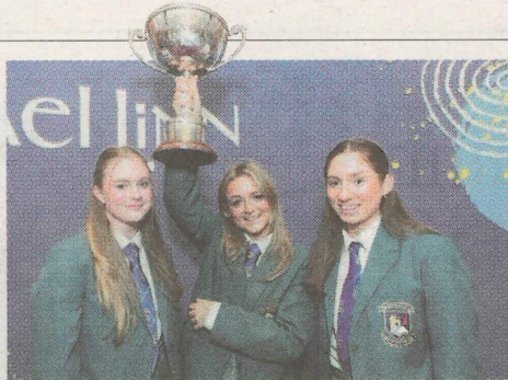
Celliúradh: Foireann Coláiste Pobail, Caisleán Cnucha, BÁC, a bhain Chraobh na hÉireann Sinsear

Bronnadh buanchorn agus dearbháin dar luach €1,000 ar an fhoireann bhuacach sa dá roinn den chomórtas, agus bronnadh dearbháin dar luach €250 an fhoireann ar na foirne eile a bhí rannpháirteach san ócáid.